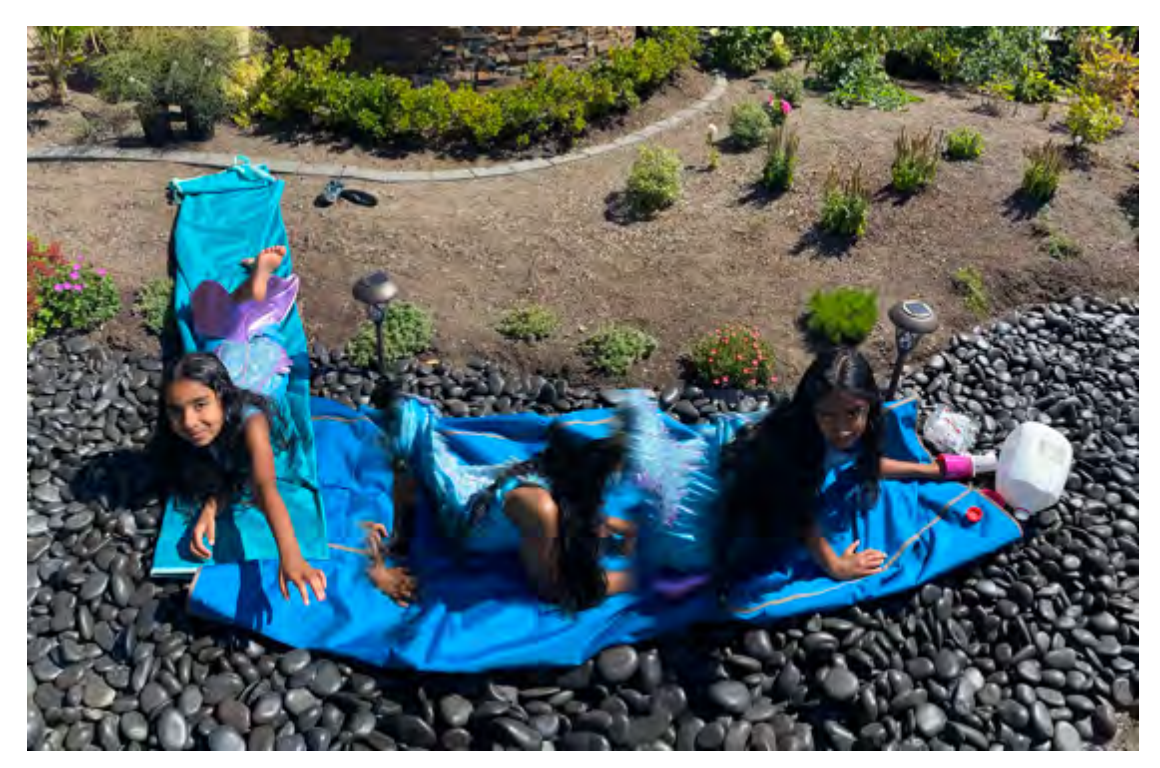
Embodying a dolphin swimming in the ocean and encountering plastic waste, May 2020. Prompts: Looking at documentaries of ocean life and plastic pollution. Discussing memories of watching ocean life from our different trips to Maldives, Hawaii and San Francisco and aquariums in India and the US. We inquire into two modes of being: 1) Cross-species empathy and 2) 'Becoming' another species. In the empathy mode, they are human beings trying to help an animal in distress while in becoming another species they dance as if they are themselves the animal experiencing the distress. Questions from the children: Why did the dolphin eat the plastic? Why does it not know that plastic is not yummy food? What will happen to the dolphin if it eats a lot of plastic? Will it get sick? Will it die? Why is there so much plastic in the ocean?

I asked them to try different movements in response to the two modes of being: 1) Cross-species empathy and 2) 'Becoming' another species. The children explored different movements such as writhing, struggling, curling up into a ball, distress calls, carrying a hurt animal, etc. They took photographs of each other in different postures and facial expressions and actively discussed which movements looked like a dolphin, what if they could try this in the swimming pool and photograph underwater with a debate about how iPhone pictures can really show what they were feeling when they were dancing. When they shifted to dancing outdoors, they started adapting to the site, adding picnic blankets over the black stones to allow for a gliding movement and altering the length of the movements. In an interesting way, using panorama technology functioned in integrating their little minds and bodies to make sense of themselves in the context of the environment. In reflecting on the dolphin series of images, the two most important aspects of using technology and the screen that stood out in how they were learning and how their thinking was changing as a dynamic response to the screen are: