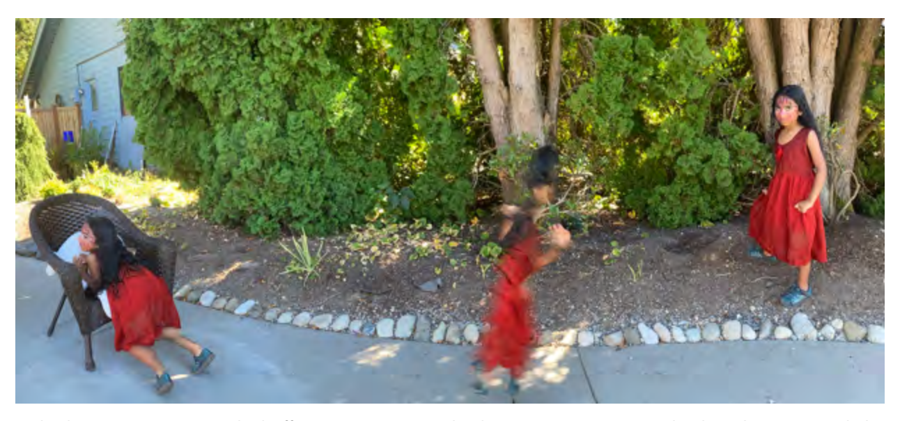
Embodying a tiger crossing the buffer zone to prey on a lamb. May 2020. Prompts: Why does the tiger attack the farmer's lamb? How much space does an adult tiger need in the forest? Questions from the children: Can we save the tiger? What can children do to help our planet? Am I a tiger or am I myself?

An interesting question that my 5-year-old posed was: "Am I a tiger or am myself?" As a child, she was easily able to move back and forth between a 'tiger state' and 'herself' and examine her movement in digital and real time and space. Being part of a generation that is so tuned to technology, my kindergartener would look at the images and tell her sister, see I look like this (making an expression or a posture) and then she would playfully come up with more jumps or rolls or more facial expressions asking, "do I look like the vulture is dying?" or "hmm how long should the tiger wait, I am hungry now-now (roar)." Her sentences conflated her identity with the identity of the animal. Also, interestingly she tried to respond to the excitement of her movement as a digital presence. This is quite a contrast with my teaching Bharatanatyam to her when I emphasize perception rooted in the physicality of the body and the tuning to inner and outer rhythm. Her conflated identities paved ways for me to think more about her movements embodying a tiger and her experiences of responding to technological capture of the scene. As an artist, understanding how, what, and why the intersection of embodiment and technology could enable the creative process is fascinating.