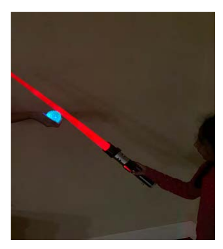
Performing coronavirus and immunity: coronavirus light-up balls and T-cell light sabers, April 2020.

When we perform this with a spiky light-up ball, it is easy to denote 2 states: an initial virus entry into host and the lit-up ball showcasing active viral replication mechanisms inside host.