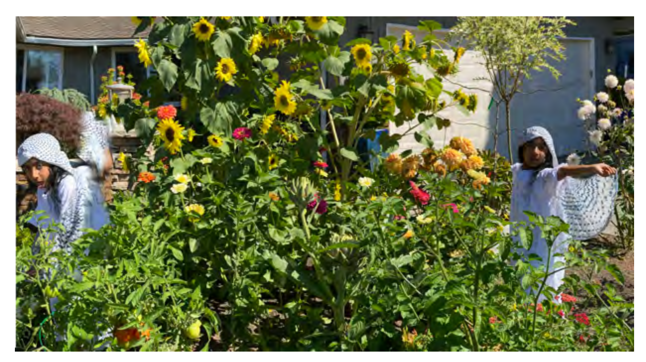
Enacting a vulture flying to feed on carrion and feeling sick later. May 2020. Prompts: What should we do if there are two animals that need to be saved, do we pick the most useful one? How should we think when we have interconnected issues? Questions from the children: Do animals that become endangered always become extinct? Is it possible to help both the cows and the vultures? Why do you say that the earth needs biodiversity?