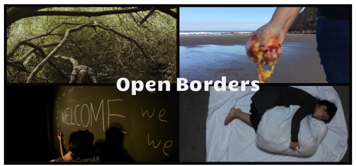
Still from Open Borders, 2015.

Badeka from AVDP (Athens Video Dance Project-International Dance Film Festival): AVDP was created in order to show our works. As artists-curators we were interested in treating the featured artists with care and respect. We wanted them to be happy and we treated them as we wanted ourselves to be treated. This ethos of care was recognised by our followers through time and increased the audience which initially consisted of local artists. This kind of care is not measured in terms of financial profit but rather as an attitude that promotes visibility for the artists in international festivals and platforms. Ethos of care and respect for the participating artists also builds their trust towards the curators.