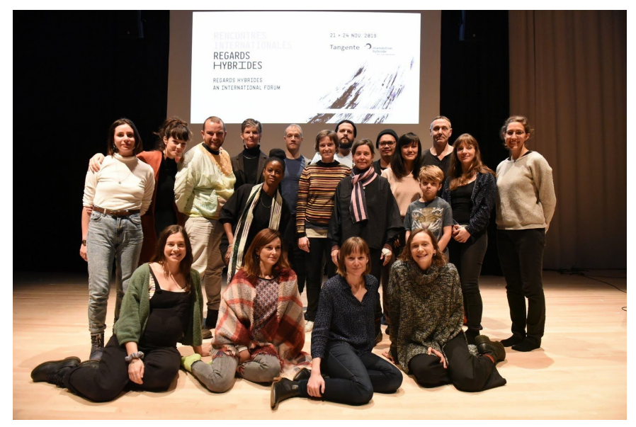
Participants at Regards Hybrides, an International Forum.

In the months that have passed since Regards Hybrides , its importance resonates even more deeply. As our screens become overly populated with creative applications of streaming media, much of it making use of familiar arts-based techniques (Alanna Thain calls it "platform determinism"), it is tempting to frame some of it as screendance. I see movement, esthetic choices, rhythmic editing and some sort of implied meaning leading to a distinctly social message. However, even media production in the service of public awareness quite quickly becomes a trope, subject to overused and at times, hackneyed couplings of form and content. What those involved with Regards Hybrides, an International Forum reminds us is that we have a very full toolkit with which to critically engage mediated images of all kinds, from creation to distribution to analysis. How we deploy these tools is what grants the screendance community a kind of global and artistic citizenship and likewise the responsibilities that come with it in the shifting landscape of the cultures in which we live.