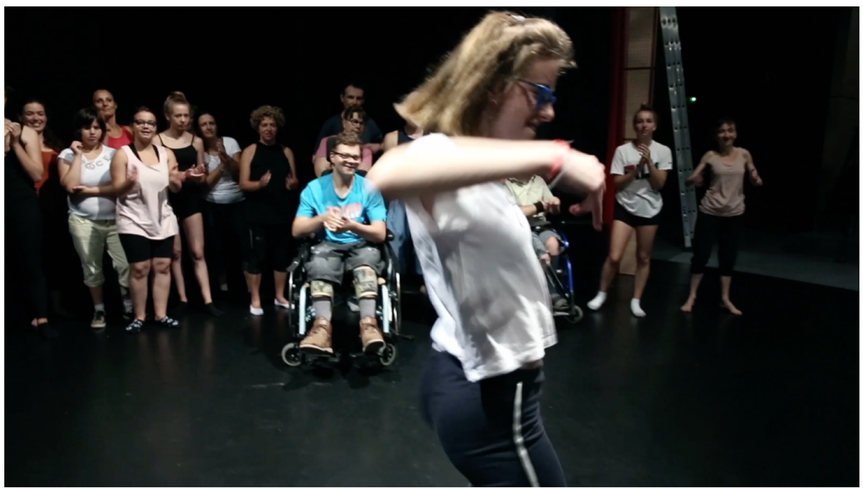
Still from Moving Bodies, 2019.

We all share a body that is political and this is a strong vehicle to support and translate emotions, sensations and to convey thoughts and questions. Moving body mixed with cinema, image speaking broadly, becomes even a stronger tool to talk to people and make people talk together. In DAN.CIN.LAB., we have screened programs on dance & equality, migration, mutation in the city space, civil rights, differences and prejudice (LGBT+). To summarise, we work towards expanding the art form of dancefilm to go beyond the dance audience.