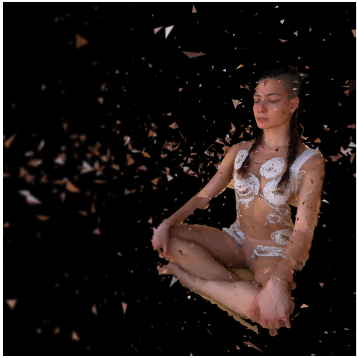
Still from Weightless (work-in-progress) 2019.