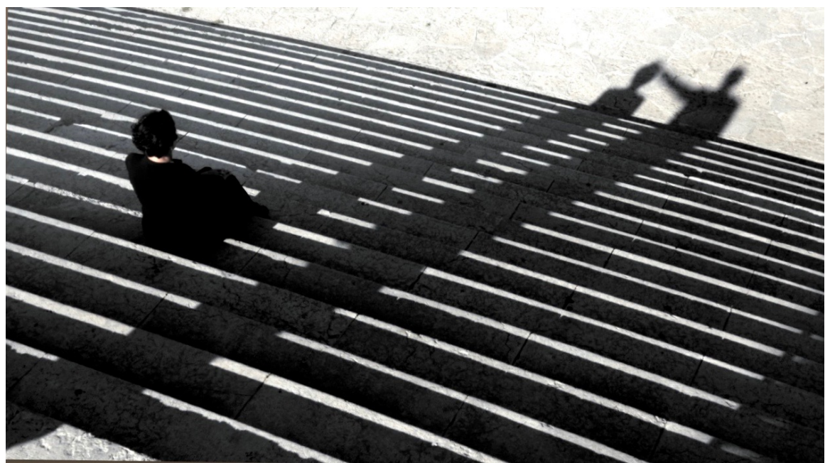
Scalamare , 2014. Dir. and chor. Jiří Kylián. Prod. Kylián Foundation, Cinematica Festival, Comune di Ancona, Marche Teatro. Film.

Specifically speaking about Scalamare , it was shot in one of the landmarks of Ancona, the Monumento ai Caduti , which is a tourist attraction and a haunt that gathers many people daily. Shoots on location built the curiosity of the residents, who visited the site day after day to observe the process of the filming or to attempt to meet the cast. When the film was ready for distribution, we invited the residents to attend the premiere and they responded eagerly to our invitation. We have to consider that videodance was unknown at that point to the local citizens and creating a work that presents their city on the screen, was very important for them. By extension, this action helped to build a sense of pride in their hometown. As Scalamare toured in several major festivals around the world, our festival's reputation increased.