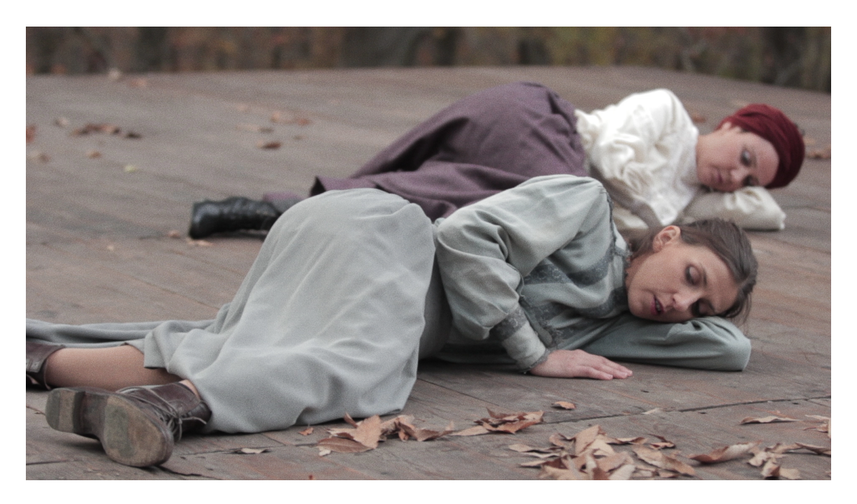
Still from Carte Blanche. Direction and choreography Collettivo Augenblick, 2017. Film.