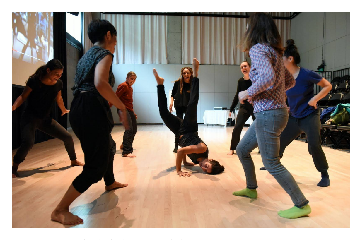
Participants at Regards Hybrides