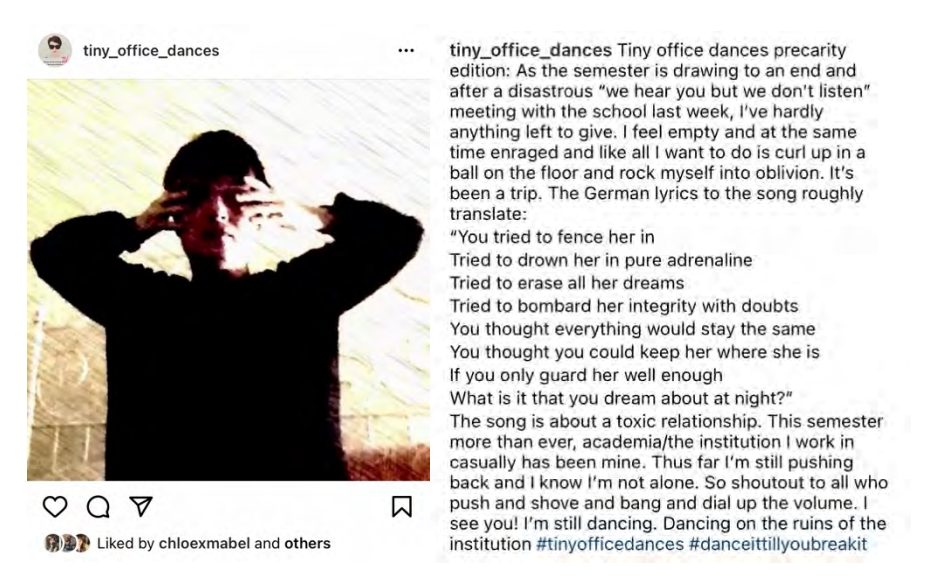
Tiny office dances post from May 27, 2019. Screenshot taken by the author.<sup>25</sup>

Sharing is caring, as the saying goes... Or, as Tavia Nyong'o has remarked, "perhaps precarity is not solely intrinsic to life in its individual existence but also in and through its collective repetition across lives."<sup>26</sup> To being, as Jean-Luc Nancy states, "singular plural,"<sup>27</sup> where precarity is, to pivot back to Nyong'o, "more concerned with compassion, with co-passion, co-presence, a being in common with that which we do not know, and with those whom we can not speak for."<sup>28</sup>