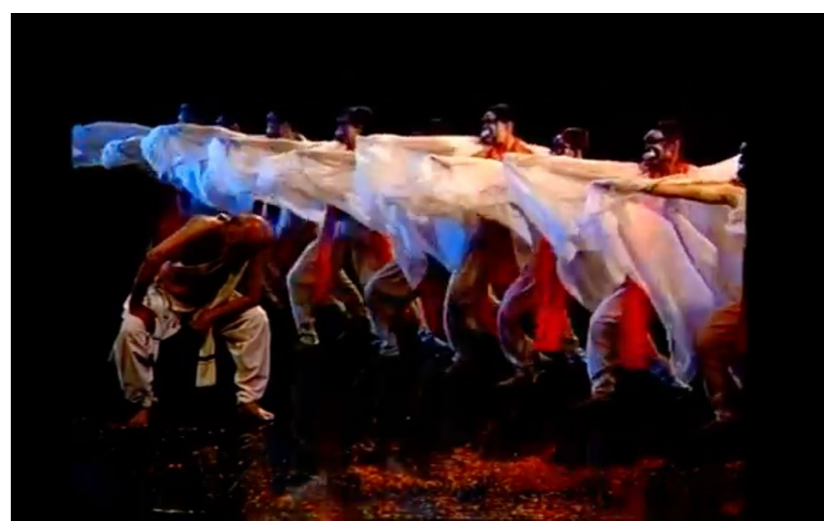
Image 14: Antim Adhyay. 23.52 min, Screenshot by Sandhiya Kalyanasundaram

For the television audience, Kamalini offered an unparalleled watching dance experience as the camera breathes through the intricate interplay of movement and stillness, slowness and speed, radiating circles of power and resistance traversing both the mind of the artist, his improvisation and the performance on the reflective proscenium stage. Thank you for inspiring generations of dancers!