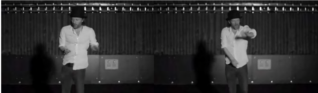
Screenshots, "Lotus Flower." Yorke continues to spasm as the music video draws to a close.

For the second verse, the same choreographic idea of gestures in intensified repetition returns. This time the camera changes location. It is set up higher and at a different side-ways angle. He continues to balter about, moving between losing his balance and trying hard to regain it. He kneels, claps, and loses his balance as if the ground can no longer offer stability in a clear choreographic metaphor of the experience of the financial crisis and its ensuing austerity measures. The close-up returns after this moment of imbalance. Yorke has a look of contemplative consideration with hands in what appears like a prayer position. He removes his hat once more before the jiggles, wriggles, and jerks return. His shoulders lift up and down, his legs flail and kick around, his torso cannot find proper alignment. There is no stability for him here. For the final 44 seconds of the video, Yorke is in a constant state of spasm.