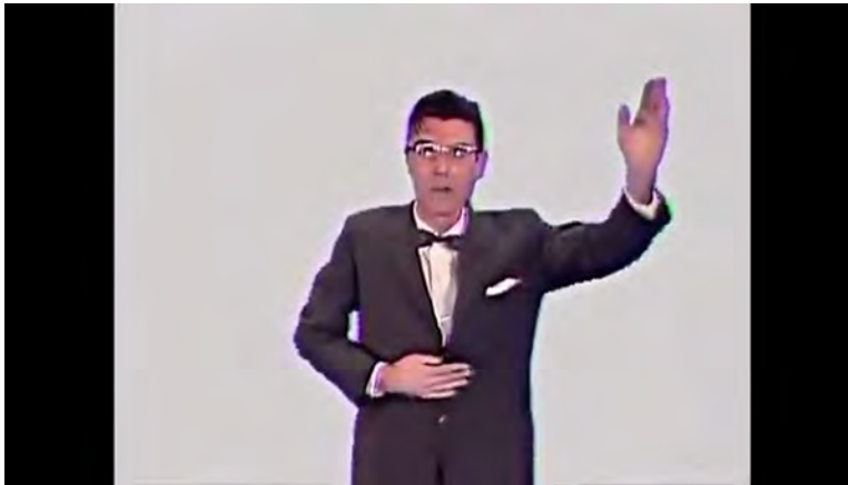
Screenshot, "Once in a Lifetime." Byrne begins his choreography with the proselytizer pose.

cheeks expand outwards to demonstrate the laborious nature of his task. After what seems like the last circulation of his ride on this unseen wheel, Byrne jerkily stops and stands to face the camera. His body lies framed in mid-shot from his waist upwards. One hand rests below his sternum, while the other arm bends at the elbow in mid-air as if getting ready to swear to an oath.