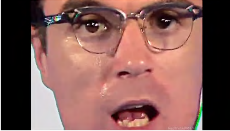
Screenshot, "Once in a Lifetime." A sweaty Byrne repeats "same as it ever was."

While the nerd Byrne spasms himself into the blue oblivion of the background, this other Byrne, who calmly lip syncs showing no signs of sweaty excess or discomfort, maintains a steady gaze with those of us behind and beyond the camera.