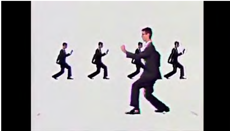
Screenshot, "Once in a Lifetime." Byrne as pugilistic cog in the machine.

was keen on disarming. That Byrne in his nerdish guise appears ready to fight the good fight in honor of patriotism and deference to the Reagan Administration is laughable considering his criticism of said administration in his film True Stories (1986). 27 However, his body's performance in the video attests to its attempt at incorpor-ating itself into Reaganomics; an unsettling, uncomfortable task full of agitation, instability, and spasms.