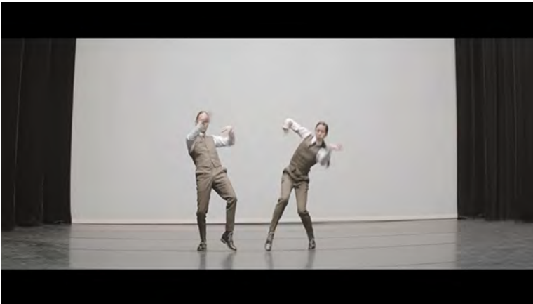
Screenshot, “Ingenué.” The final spasms they perform together.

Interestingly, these two videos rely on full-body shots for the majority of the time. Only at decisive moments in the songs does the camera offer a close-up of each of their faces. They contort their faces similarly: eyes tucked upwards into their lids, features slightly twisted, an un-self-conscious reflection into what dancing or the music might offer: unbridled release from the social inscriptions that write the body. I am reminded of what cultural geographer David Harvey writes: “a body is not a closed and sealed entity but a relational ‘thing’ that is created, bounded, sustained, and ultimately dissolved in a spatiotemporal flux of multiple processes.” 39 These close-ups might be short moments where their choreographed bodies offer ways to dismantle or disturb the apparent chaos of the spasm. They are chaoides, “the living decoders of chaos that manage to avoid absorbing the negative psychological effects of chaos” by learning how to manage the struggle through corporeal fluidity.