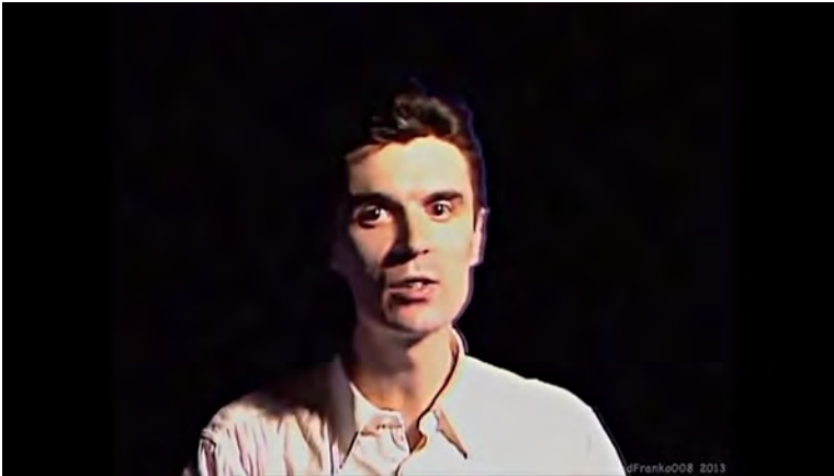
Screenshot, "Once in a Lifetime." Byrne the "rock star" stays in control without visible sweat.

While the nerd Byrne spasms himself into the blue oblivion of the background, this other Byrne, who calmly lip syncs showing no signs of sweaty excess or discomfort, maintains a steady gaze with those of us behind and beyond the camera.