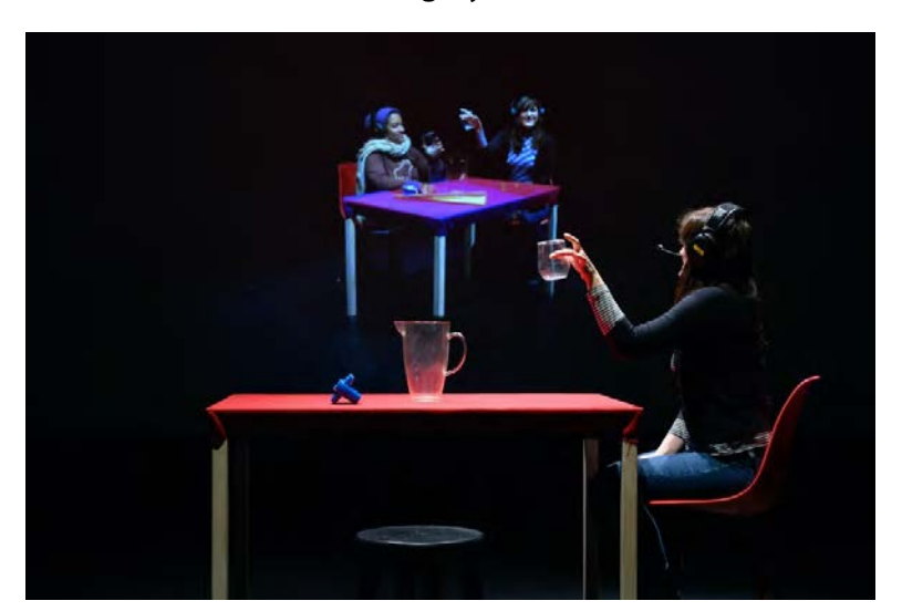
Test audiences in Being/With: Live.

be new to the experience of navigating the video installation, whereas the dancers will be familiar with it and prepared to take the movements and choices of the audience members and lift them a little bit and amplify them within the context of the video apparatus. The dancers provide subtle guidance and visual suggestion. So those are the elements: the live feed imagery, a verbal conversation and a movement interaction.