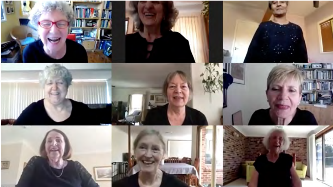
The dancers are having fun on our black themed session, singing along to AC/DC!

The creative objectives of Together We Dance were two-fold: creating group movement ideas and choreography specifically for the frame. Inspired by film director Mike Figgis, whose film Timecode (2000), brought choreography to the fore as the film is a totally improvised piece of cinema shot on a hand-held camera for 90 minutes in real-time. After participating in a workshop with Figgis in Amsterdam in the early 2000s, I was inspired to create my own split screen film, Super Power (2011), which screened in over ten international film festivals. My introduction to split screen, through Figgis, had taught me to consider my choreographic and editing options whilst filming, and to execute both roles, filming and editing, in consequence to each other. In this sense, editing becomes another choreographic device.