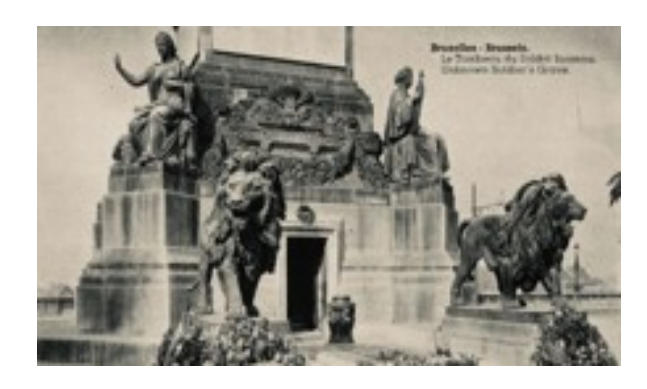
Image 2: Tombeau du Soldat inconnu, Credit: Oliver Imfeld Image 3: Tombeau du Soldat inconnu, Credit: Archive image from the collection of Belfius Banque, Copyright ARB-SPRB, Documentation center of Brussels Urbanism and Patrimony "Service Regional de Bruxelles, Centre de Documentation de BUP" with the authorization of the Royal Academy of Brussels

Or, by sliding on her back down the stairs of Mont des Arts , she makes an allusion to the water that used to cascade down the center part of the stairs when it was designed for the International Exposition in 1910.