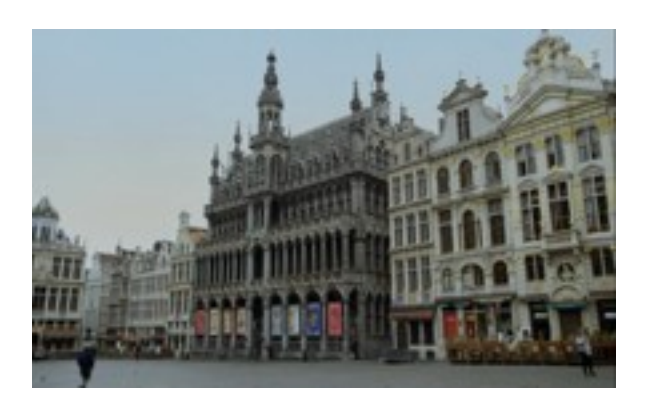
Image 12: Grand Place, Credit: Archive image from the collection of Belfius Banque, Copyright ARB-SPRB, Documentation center of Brussels Urbanism and Patrimony "Service Regional de Bruxelles, Centre de Documentation de BUP" with the authorization of the Royal Academy of Brussels

Image 13: Grand Place, Credit: Oliver Imfeld