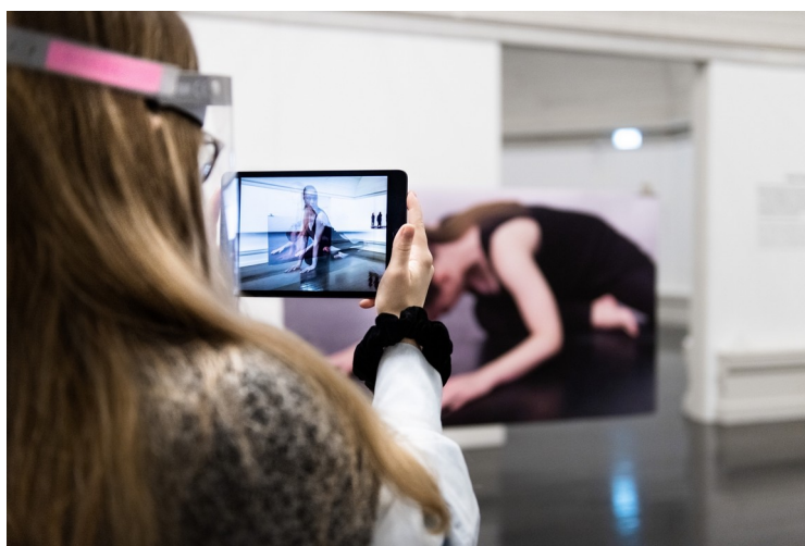
Figure 2 Conspiracy Archives 11 December 2020 at Close Encounters , for Dansehallerne and Den Frie Centre of Contemporary Art

In this way the AR app allows the visitor to immerse themselves in the resonant bodily states of the dancers archived in the video and tagged on the image in the installation. This type of interaction with an archive, not only highlights temporal shifts between past and present but also demonstrates how archived somatic 4 and affective 5 bodily states may ripple outwardly like resonant waves across old and new technologies, bodies and space, servers and Wi-Fi, mobile devices, and apps, to audiences who embody these states within a wider somatic field. By triggering the archive with the app on their device (Figure 2), the interaction becomes a performative act, as without audience participation, the archive lies dormant.