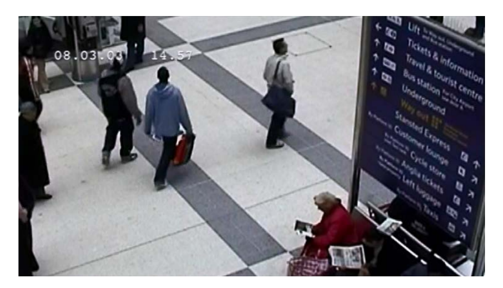
Screenshot. The Truth

The Truth intersperses dance scenes with surveillance-style footage taken in a public station. Seen side-by-side with the surveillance-style footage, the dance scenes function effectively as a kind of surveillance through which viewers voyeuristically observe the dance(rs). I have drawn my understanding of voyeurism largely from scholar Clay Calvert's concept of "mediated voyeurism" that he argues dominates contemporary culture and that he defines (in short) as "the consumption of revealing images of and information about others' apparently real and unguarded lives ... frequently at the expense of privacy and discourse" (my emphasis).<sub>30</sub> In The Truth , viewers consume revealing images of and information about their everyday lives. However, the screendance manipulates the aesthetics of surveillance as a means of setting up viewers to feel as though they are watching unsuspecting, anonymous people. It is for this reason that I will here apply surveillance theory to a work that does not make use of actual surveillance but nonetheless positions viewers to relate to its subjects within surveillance space.